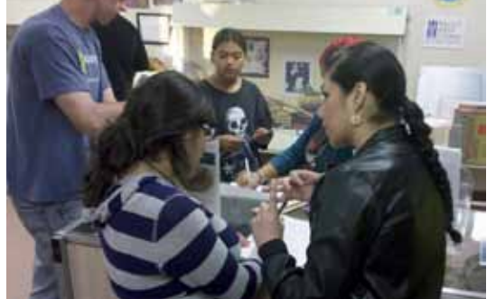
We thank the San Manuel Band of Mission Indians for their continued support of our Native Students. Together we continue to bring a greater future for our Native children.

students are not aware of what they need to do to get into college. For this reason, AIR not only provides "academic success topics" (such as taking the SAT's, choosing college preparation courses in high school, completing college admissions applications, filling out the FAFSA form, finding and applying for scholarships) through workshops and small group discussions but has been actively approaching and working one-on-one with students outside of the normal AIR Program sessions, making sure students are on track and meeting college prerequisites before they apply. In order to ensure Native students success in high school it is important to be checking in with them on a weekly basis to see how they are doing. Many are often shy or feel uncomfortable asking for help. Therefore, our new approach of helping and guiding students during the college application process, academics, time management skills, and how to apply to financial aid has been the key to students success.